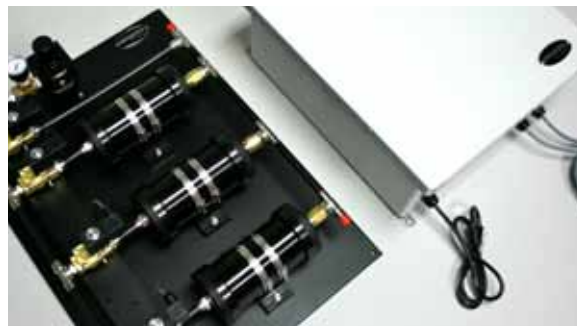
SmX-4D Controller and Chamber Module